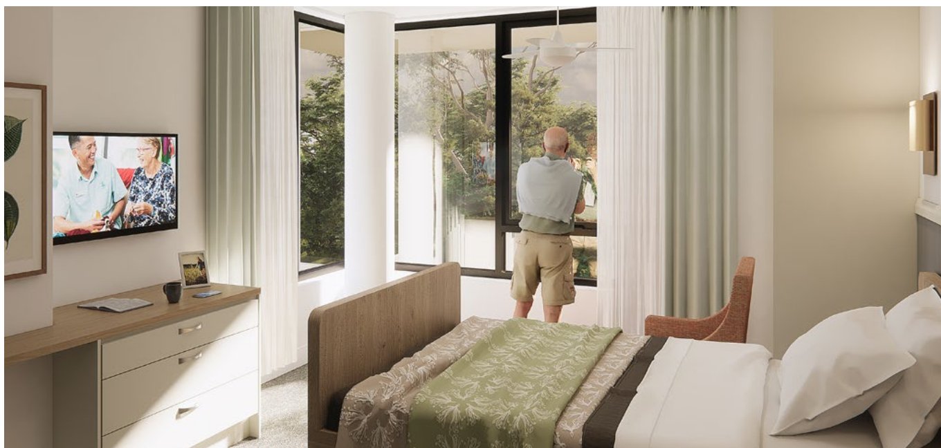
Top: Concept drawing of the Apartment Room layout. Final plans subject to change. Above: Artist impression of Single Room with Ensuite.